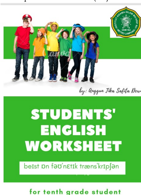
Picture 1. Cover of students' english worksheet based on phonetic transcription.

After analyzing the needs the next step is product design. There are a number of things to do in the product development stage of the Students' English worksheet based on phonetic transcription. After analyzing the needs, it is continued by collecting data by conducting a study of the material, teaching materials based on phonetic transcription. Phonetic Transcription was chosen because many of the students are difficult and there are still many mistakes in pronouncing English sentences, so make a learning material based on phonetic transcription that will help students in improving how to pronounce English correctly and correctly(Cox & Fletcher, 2018). After gathering information, the authors then make the design of students' English worksheets based on phonetic transcription, so that it is beneficial for teachers and students in improving the quality of learning. The next stage is product design from the beginning to the end of the product manufacture(Ferjan Ramírez et al., 2017).