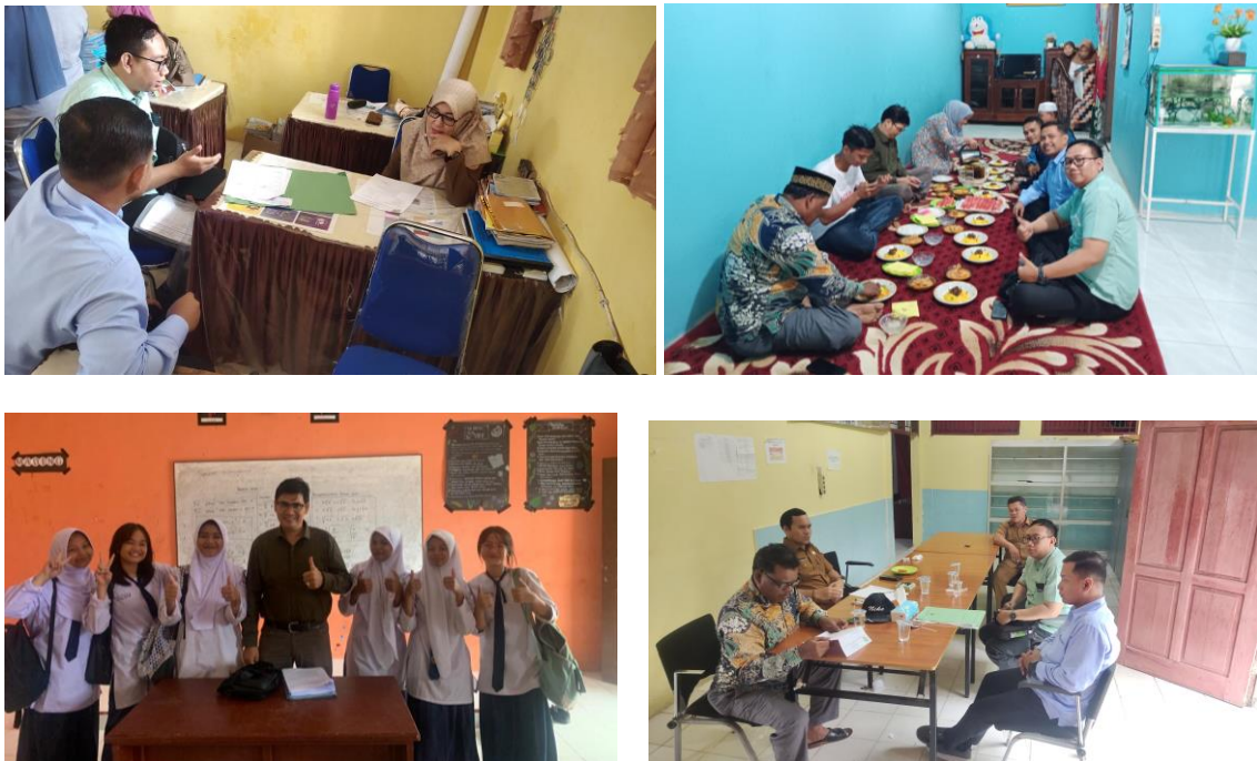
Figure 2. Field Observation with teachers, MAA and students

To find out the implementation of learning, researchers conducted interviews with students in the class. In delivering the material, the teacher uses printed books as a material learning resources, using oral and presentation methods. Learning activities went well, and there was a question and answer session (P. 12). Another opinion expressed by students was that in learning, I feel teachers should be more diverse in using learning resources, not just printed books. This will make learning more interesting and effective (P. 13).