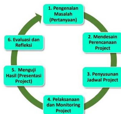
Figure 3. Six steps of Project Based Learning

When used in the classroom, educators and students can collaborate to create projects, project plans, and schedules. Since the implementation of learning is typically done as a task outside of face-to-face interaction, with the exception of reporting project results, instructors can construct student worksheet instruments to facilitate this learning. Teachers must create a project assessment instrument for the evaluation. The following diagram illustrates the project-based learning model's learning stages: